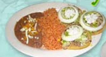
6. Homemade Sopos