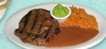
2A. La Palma Steak (Ribeye)