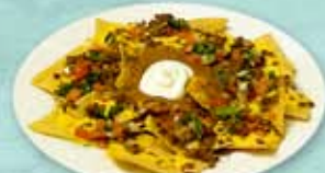
32. La Palma Nachos