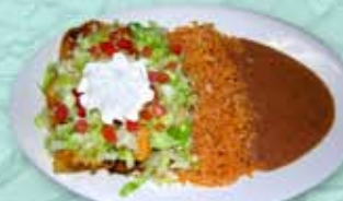
7. Homemade Tamales