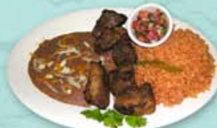
17D. Homemade Carnitas