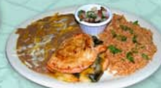
1. Pollo Relleno

710 St. Mary Street • Thibodaux (985) 448-1221