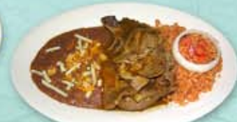
17C. Chuletas de Puerco