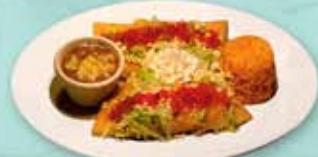
18A. Homemade Tacos Azteca